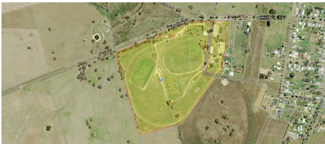
Figure: Aerial view of site and surrounds

The site, known as Boorowa Showground, has an area of 25 hectares and a frontage to Ballyryan Road of 650 metres. The site is currently utilised as the Boorowa community and sports precinct, where improvements include ovals, netball courts, stables, racecourse, grandstand, pavilions and several amenity buildings. The site comprises several parcels all of which are classified as community land under the Local Government Act, 1993 .