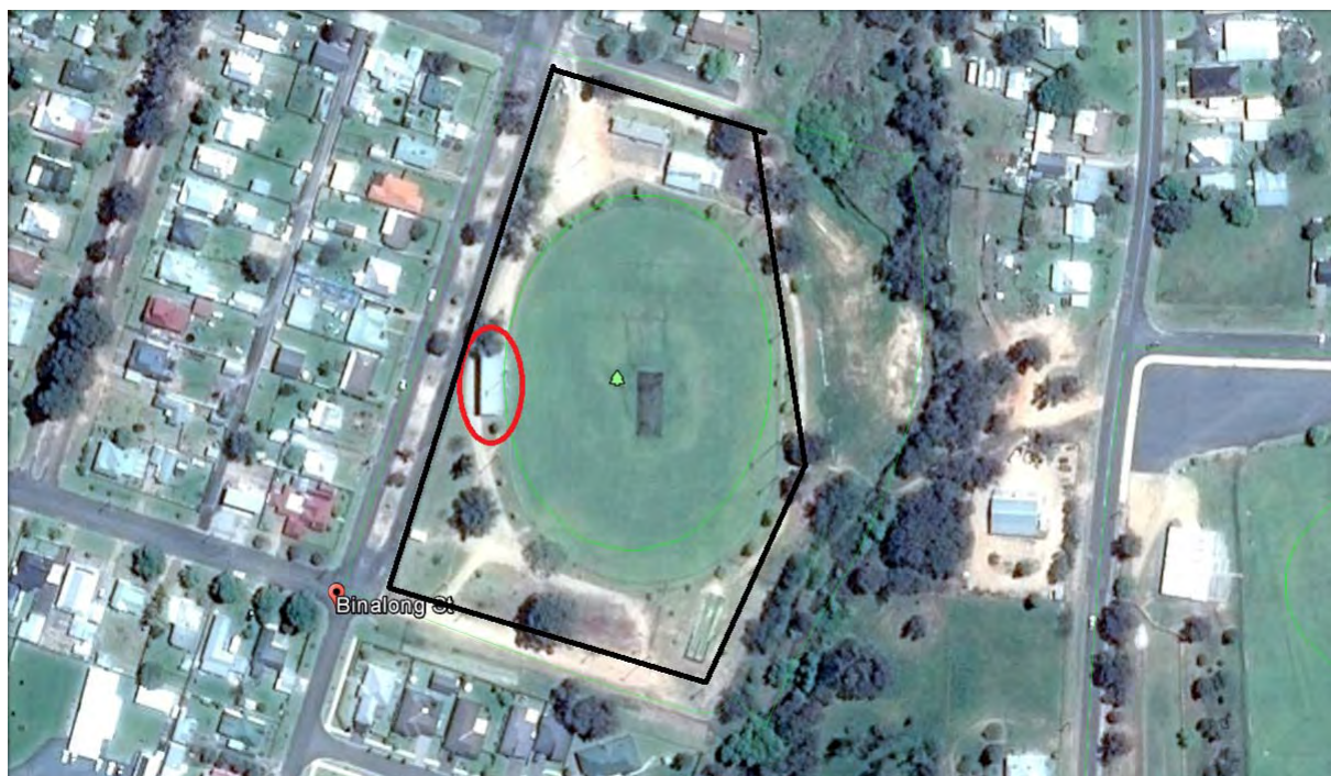
Figure 2 – Aerial view (grandstand circled)

Held in the Hilltops Council, Young Chamber, 189 Boorowa Street, Young