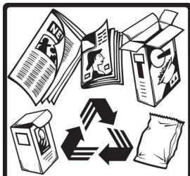
Paper & cardboard