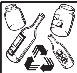
Glass bottles & jars