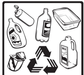
Plastic bottles & containers

Paper, 'Junk Mail', magazines, Newspapers, Cardboard boxes (flattened), Pizza Boxes (clean), Office Paper & Envelopes, Clean Paper Bags, Egg Cartons, Empty Glass bottles & Jars (Green, Clear or Brown), Hard Plastics, Ice Cream Containers, Plastic bottles, Juice Cartons, Margarine tubs, Milk Cartons, Shampoo Bottles, Empty Aerosol Cans (empty), Aluminium Cans, Food Cans (clean), Soft Drink Cans